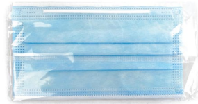
Single Pack Option Available