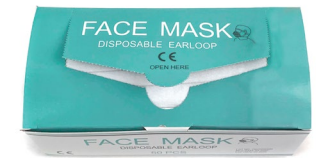
Standard Pop-Up Box