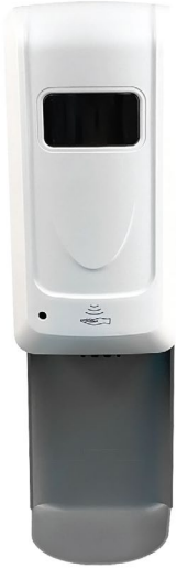
Wall-Mount Model SD01+-WM

SD01+ TOUCHLESS AUTOMATIC HAND SANITIZER DISPENSER No Touch | Bulk Refill Compatible | Gel, Liquid or Soap