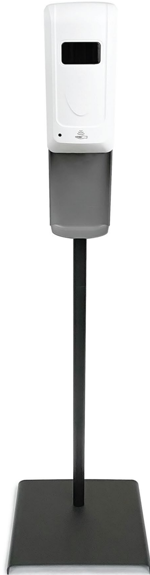
Freestanding Model SD01+FS

HS03 HAND SANITIZER GEL FDA Approved | Refill, Kills 99.9% Germs & Bacteria, Aloe Moisturizer