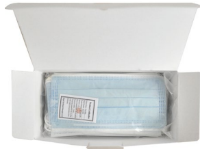
Standard packing box